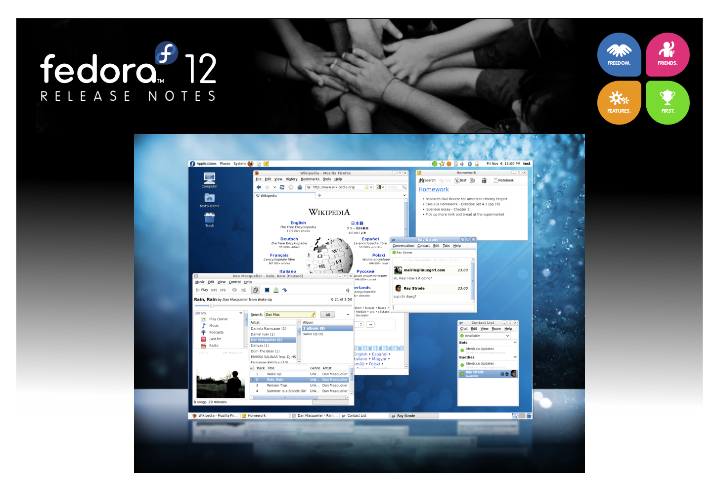
FEDORA: UNITING COMMUNITY, TECHNOLOGY & FREEDOM.